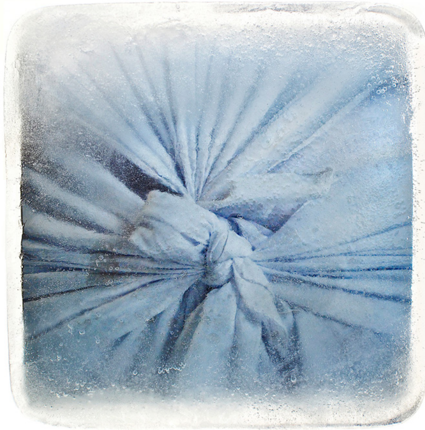
Last Glimpse: Mother's ashes. This photo captures the last glimpse of my mother just before her burial. The box, carefully wrapped in fabric, contains her ashes and was originally photographed by my sister who was holding them during the funeral.