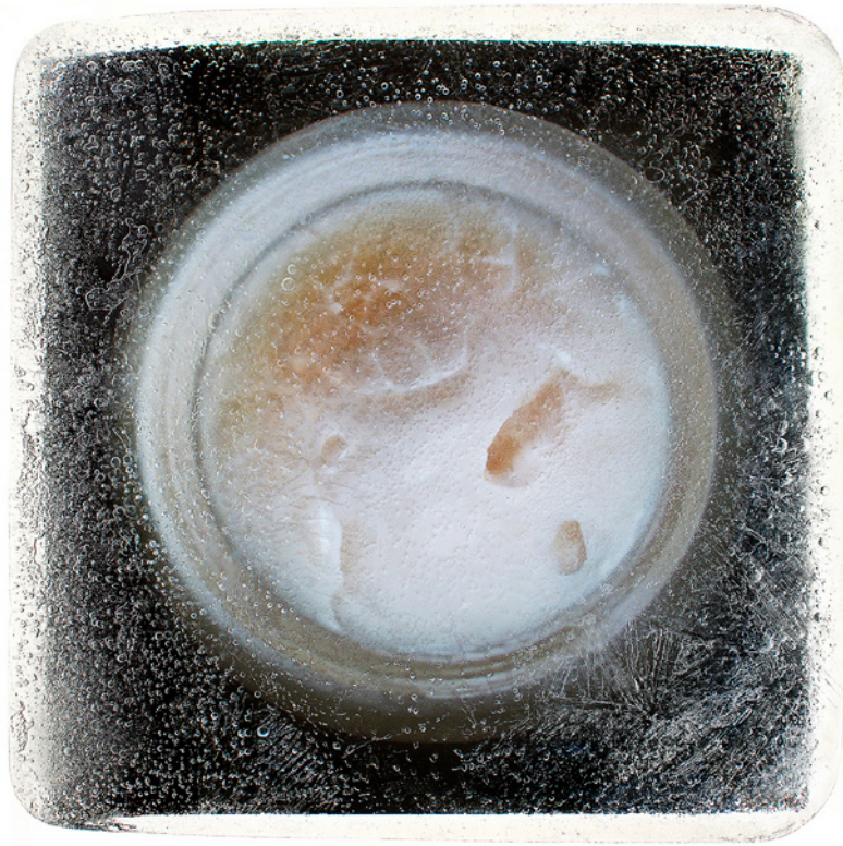
Finger trace in the jar.

This photo captures the last glimpse of my mother just before her burial. The box, carefully wrapped in fabric, contains her ashes and was originally photographed by my sister who was holding them during the funeral.